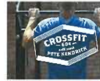
CrossFit Explained - Is It For You? (lululemon)