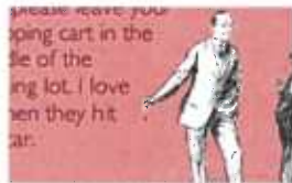
You CANNOT MISS These Idiots We See in the Grocery Store Rant Chic