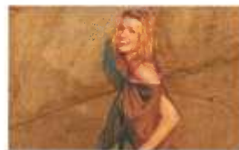
These Are The 10 Sexiest CEOs The Richest