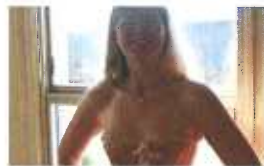
One Woman Wore a Corset Every Day...and This is What Happened You Beauty