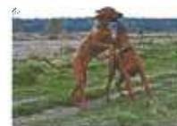
13 Overprotective Dog Breeds (Dog Reference)