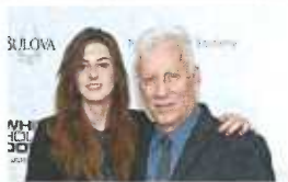
10 Celebrity Couples with a Large Age Gap Celebrity Gossip Answers