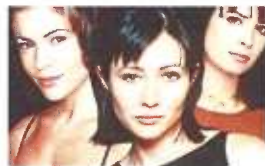
10 Celebs Who Absolutely Refuse to Work Together Celebrity Gossip Answers