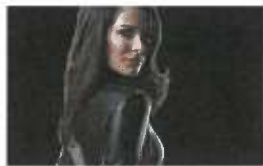
5 Richest Commercial Actors The Richest